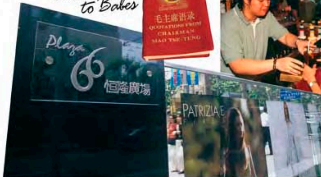
Far left: Signs and posters advertising Plaza 66 shopping mall, Shanghai