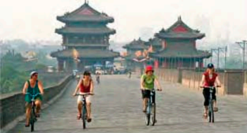
Left: Riding along the top of the City Walls, near West Gate, Xi'an